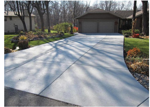
Long-lasting beauty with minimal maintenance.