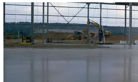
Reduce cracking and shrinkage.